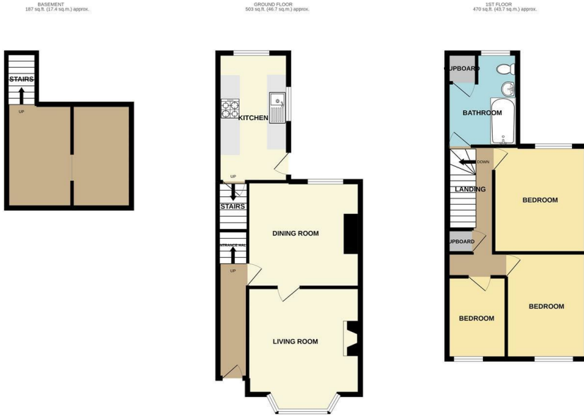
TOTAL FLOOR AREA: 1160 sq ft. (107.8 sq.m.) approx. Whilst every attempt has been made to ensure the accuracy of the floorplan contained here, measurements of doors, windows, rooms and any other items are approximate and no responsibility is taken for any error, omission or mis-statement. This plan is for illustrative purposes only and should be used as such by any prospective purchaser. The services, systems and appliances shown have not been tested and no guarantee as to their operability or efficiency can be given. Made with Metropac v2022