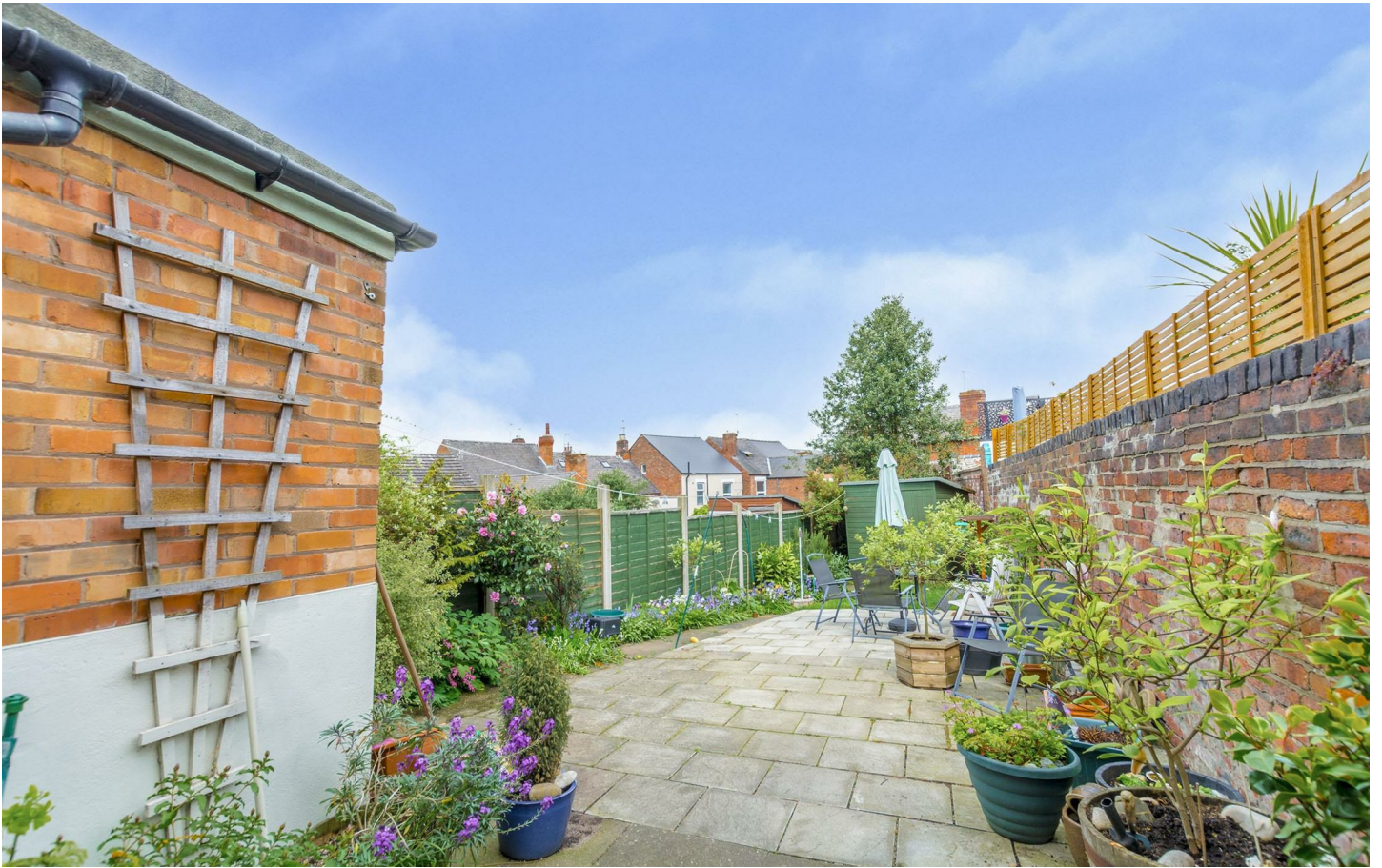
A BAY FRONTED VICTORIAN THREE BEDROOM SEMI DETACHED HOUSE.

Robert Ellis are delighted to bring to the market this handsome bay fronted Victorian three bedroom semi detached house situated within this popular and established residential location.